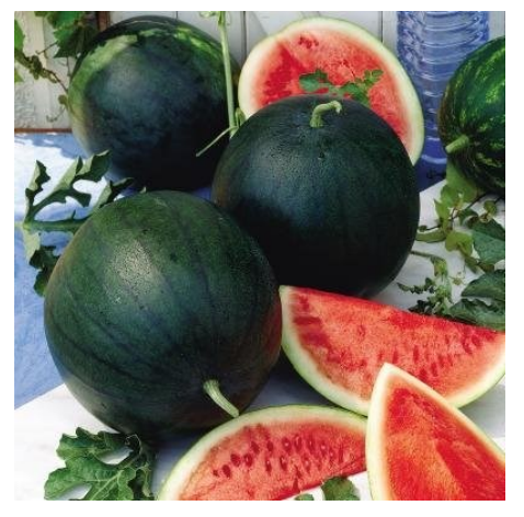
Sweet Siberian & Petite Yellow Watermelons