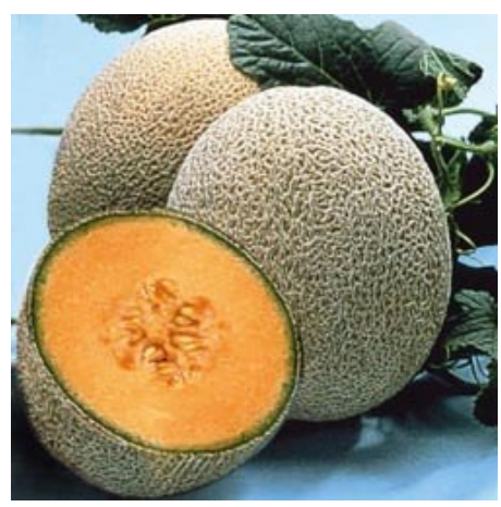
Eldorado Dolcissimo, Hales, Schoons Hard Shell, Retato Degli Ortolani - Cantaloup