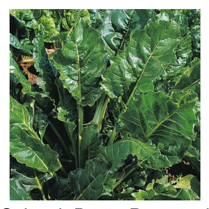
Spinach Beet - Perpetual