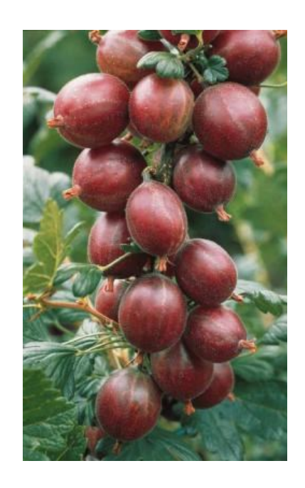
Hinnomaki Green & Invicta